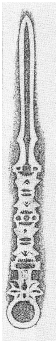
Sue-Sôshû Fusamune (総宗)